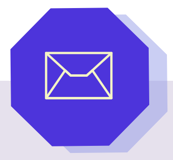
24/7 Client Support